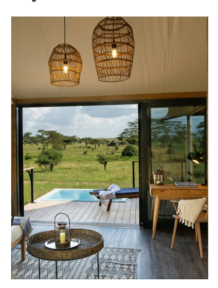
Day 6 - 7: Game drive to Serengeti National Park

After breakfast game drive to Serengeti national Park. The Serengeti is home to the world's largest populations of Wildebeest, Zebra, Cape Eland, Lion, Cheetah, Hyena and Gazelles. The scenic beauty of the sky with cool nights and warm days makes your visit to this remaining home for great migration of large mammals incredible! Dinner and Overnight at Lemala Nanyukie.